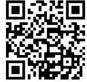
QR Code – LCO Resources Webpage